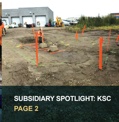
SUBSIDIARY SPOTLIGHT: KSC PAGE 2