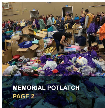
MEMORIAL POTLATCH PAGE 2