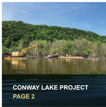
CONWAY LAKE PROJECT PAGE 2