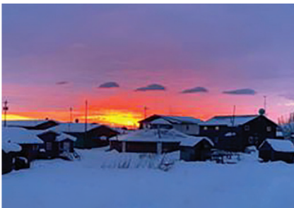
2019 ANNUAL MEETING PAGE 2