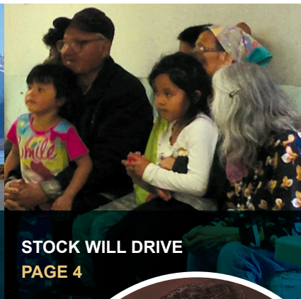
STOCK WILL DRIVE PAGE 4