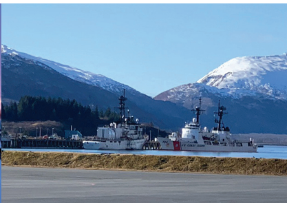
KAIYUH SERVICES, LLC PAGE 3