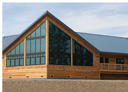
YUKON KOYUKUK ELDER ASSISTED LIVING FACILITY PAGE 2