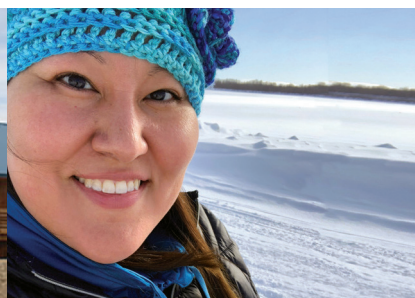
SCHOLARSHIPS PAGE 3