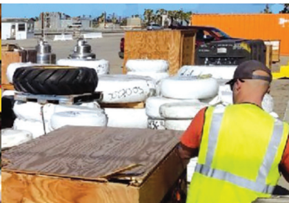
SUBSIDIARY SPOTLIGHT PAGE 3