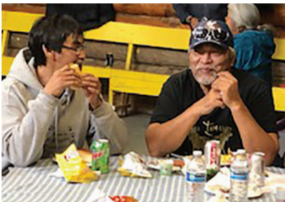
ANNUAL MEETING PAGE 2