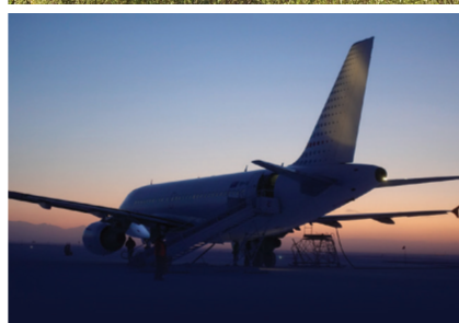
ANTARCTICA PAGE 2