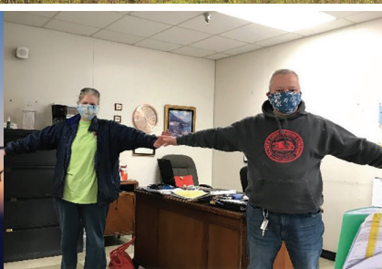
SUBSIDIARY SPOTLIGHTS PAGE 3