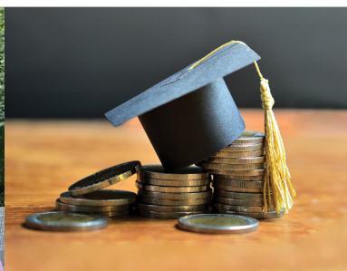
SCHOLARSHIP DONORS PAGE 3